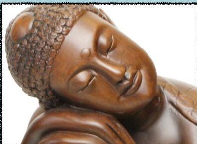
WHEN WE HAVE MINDFULNESS OF THESE OBJECTS, then peace can arise. This is mindfulness of the knower, seeing things clearly so we understand them.

mind. They are just visitors coming for a while, staying and then going away. Don't look at moods or emotions as yours. When you are not interested in them, they will go away because that is their nature, they come and they go. See everything as empty. See likes or dislikes as empty. This way, the mind becomes pure; when we act or speak it's just a process of actions, no intentions, no kamma.