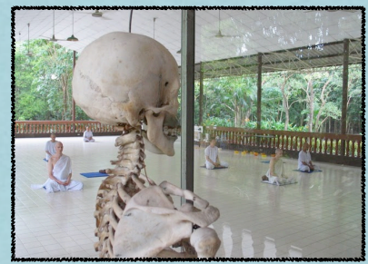
THIS BODY must be understood as making up of only the four elements (earth, water, fire and air) and the elements of space and consciousness. They come together for a period of time and then will deteriorate.