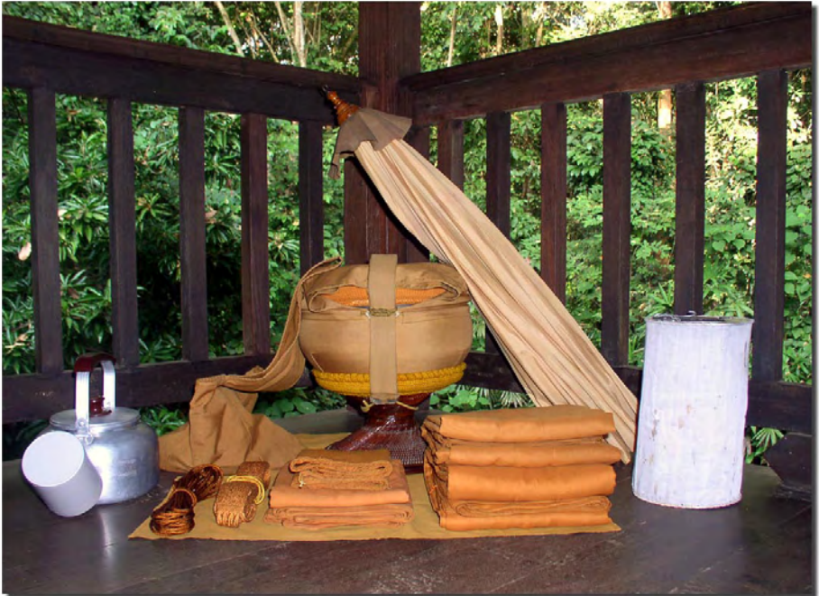
A monk's requisites