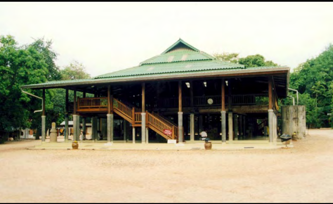
The Sala at Wat Pa Baan Taad