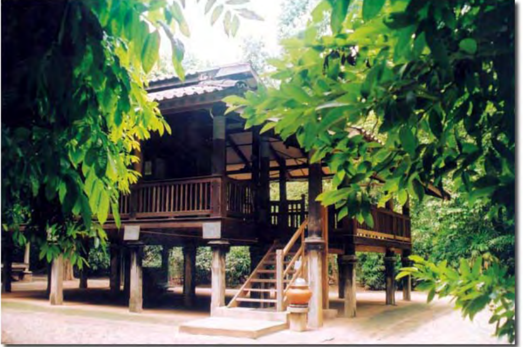
Ajaan Mahā Boowa Ñāṇasampanno's Kuti