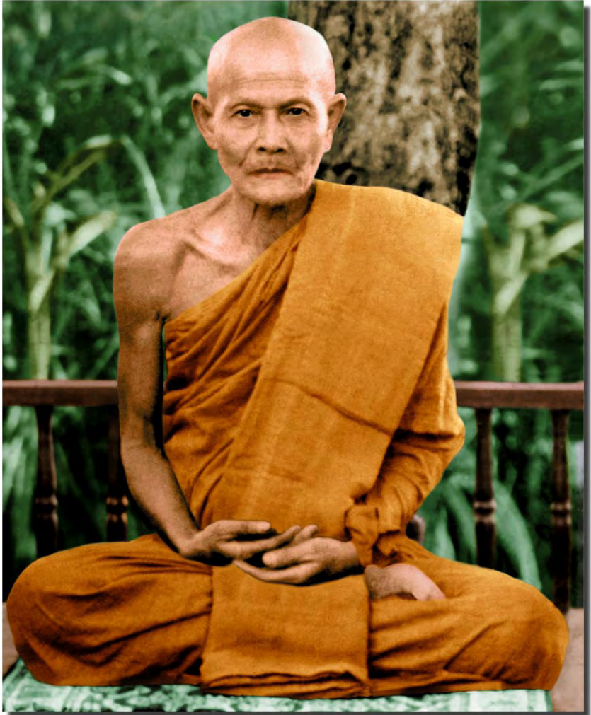
Ajaan Mun Bhūridatta Thera