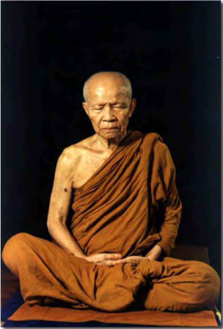
Ajaan Mahā Boowa Ñāṇasampanno