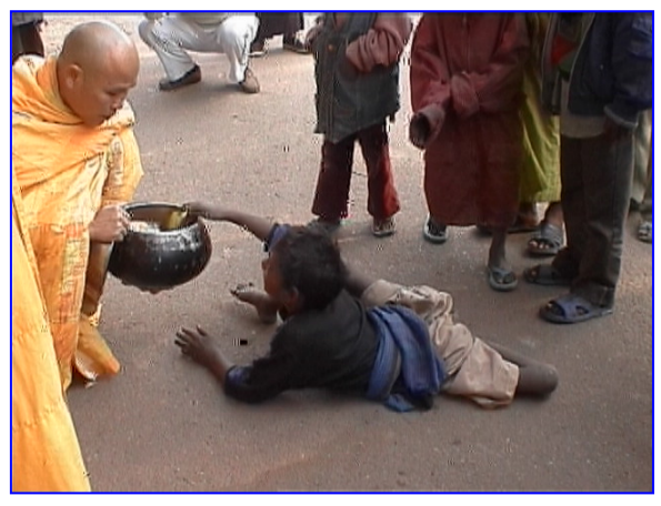
Kamma does not give way to anyone