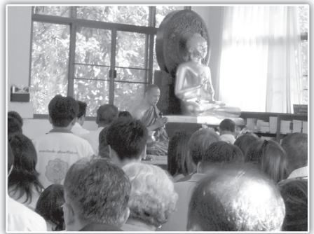
Listening to Dharma Talk